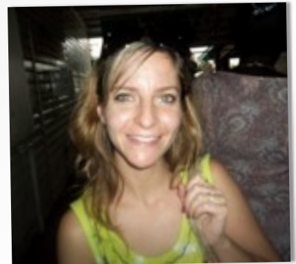
JUST ARRIVED IN PNG!