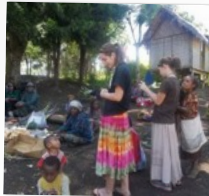
FIRST VILLAGE EXPOSURE