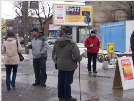
Passing out coffee and scripture verses!

We are also joined by some of our friends from the First Baptist Church of Gdansk. We have been able to share the gospel of Jesus with some and encourage others.