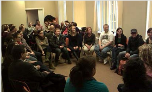
Poles and Americans at USB Cultural Exchange!